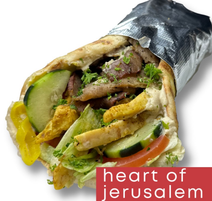
heart of jerusalem

All sandwiches come wrapped in a grilled za'atar pita with hummus, lettuce, cucumbers, tomatoes, banana peppers & magic sauce.