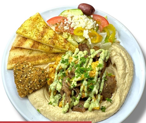
kids hummus bowl